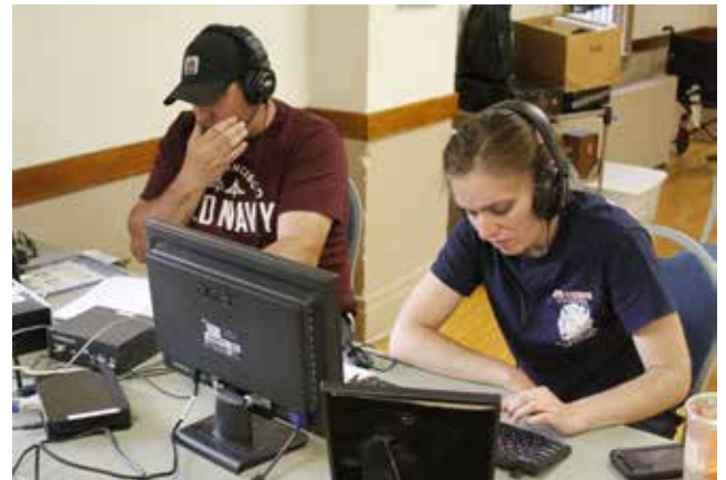
Field Day 2019 was the last to operate from the Masonic Lodge, using two Class A stations.