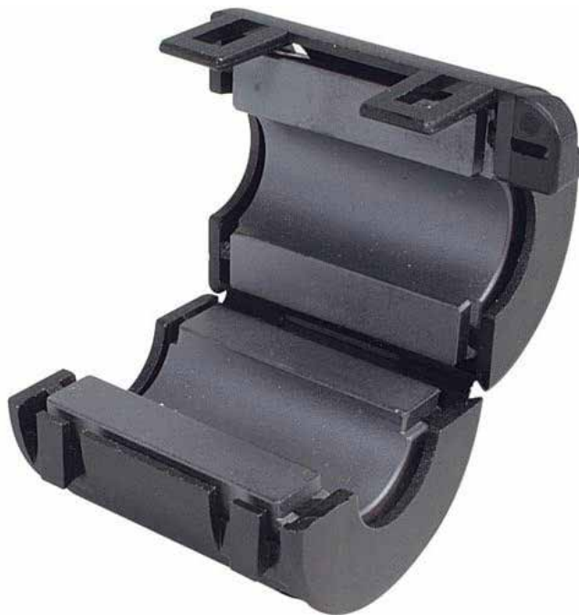
Ferrite cores placed on your microphone cable can often help eliminate RFI in your audio

A number of Astron® power supplies, which are very popular because of their low cost and excellent performance, use a floating ground. This can cause an amateur transceiver to take off scanning when you transmit or set up common-mode current. The solution is to connect a short strap from the power supply's Black (negative) output terminal to the chassis of the power supply (often there is a convenient ground lug inside the cabinet). Then, connect 0.01 \mu\text{F} and 0.001 \mu\text{F} 50-Volt disc ceramic capacitors from the red ( + ) to the black ( - ) output terminals; the capacitors will shunt any RF on the DC line to ground, which now really is ground.