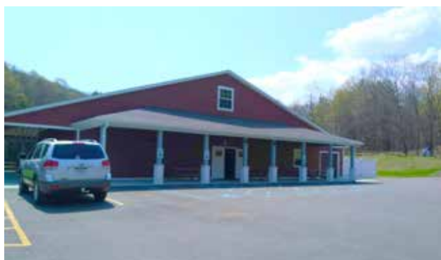
Hamfest 2021 will move to the East Greenbush Town Park's "Red Barn". The building was built in 2019 and offers exceptional facilities.

"The park location and its facilities are exceptional and is sure to make a favorable impression on attendees and vendors alike," said club President Bryan Jackson, W2RBJ. "And, regardless of weather, our event will have plenty of covered space, including a large interior space with air conditioning, and adjacent outdoor covered space, including a covered pavilion. And, it's a beautiful spot"