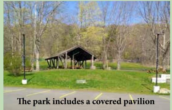
The park includes a covered pavilion

East Greenbush Parks and Recreation officials jumped in to help the club when it found itself in need of a new venue. For instance, park facilities are usually not open until 8 am, but they have agreed to let EGARA set up Friday afternoon and access the building at 5:30 a.m. to get set up.