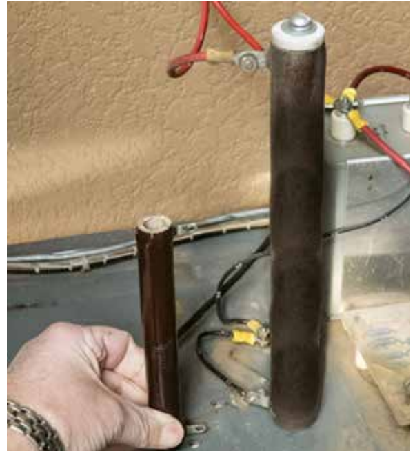
Replacing a resistor (left) with one of the same value but a higher wattage rating (right) can avoid failure due to heating.

Think Ohm's Law when you are working on your gear. It answers your questions and makes perfect sense.